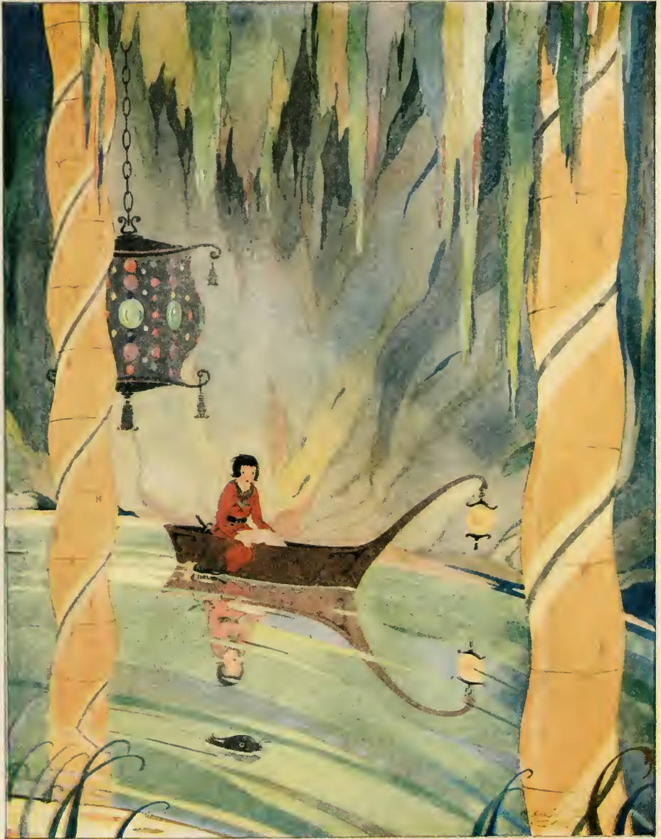
The Prince begins his journey through the caverns.